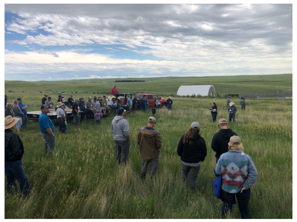
2023 NDGLC Summer Tour – Feiring Ranch

Increase our financial support of projects which produce educational aspects around the value of prairie landscapes, healthy soils, and grass-based regenerative practices.