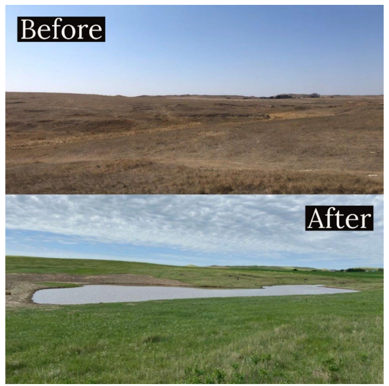
Raab Wildlife Management Area wetland restoration project through Livestock & Wildlife Dams OHF grant

Utilize existing and develop new programs for the voluntary retention, restoration and creation of grasslands, wetlands and associated habitats. We will contribute to the retention of 100,000 acres and creation/restoration of 2,000 acres of grassland and wetland habitats throughout North Dakota.